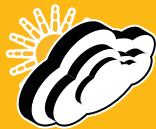
OPTIMIZED FOR ALL SUNLIGHT CONDITIONS